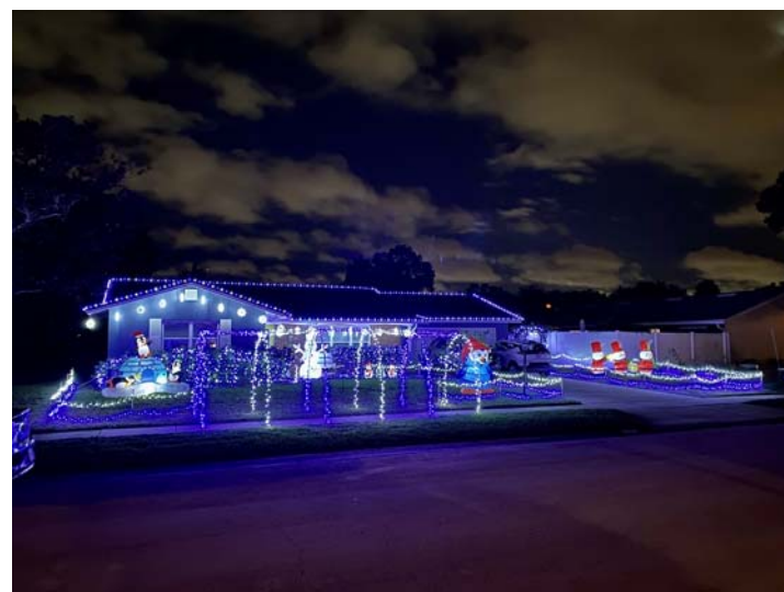
Over the Top Award 2210 King Charles Court The Foyil Family