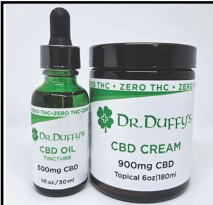
Tincture & Cream Starter Kit

Purchase a Tincture & Cream starter kit and get a free 500mg Tincture!