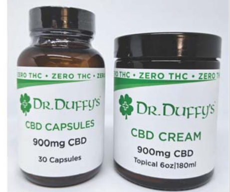
Capsules & Cream Starter Kit

A Veteran & Women Owned Business DuffyCBD.com