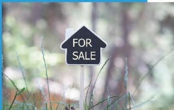
Winter Woods Market