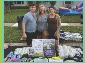
Winter Woods Spring Fling 2026

We are more than just your local realtor, we are investing in your community.